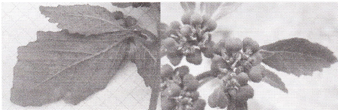
Fig. 2a,b. Euphorbia davidii a) leaf, lower side, b) Inflorescence (ciathya)

Invasiveness. According to the observations of toothed spurge populations in Serbia in the last six years, the weed easily spread and formed more or less dense patches in the crop fields, the area of distribution more than doubled. The majority of the weed population could be destroyed by row cultivation, nevertheless a lot of toothed spurge individuals remained between crops and are spreading further.